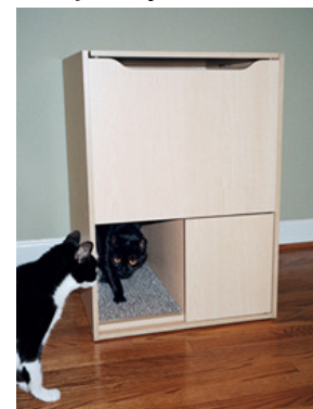
Front view of the cabinet shows cat exiting after using the litter box. Available in white or maple finish.