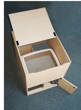
Top view of the cabinet shows top lid lifted and view of litter pan on second level.